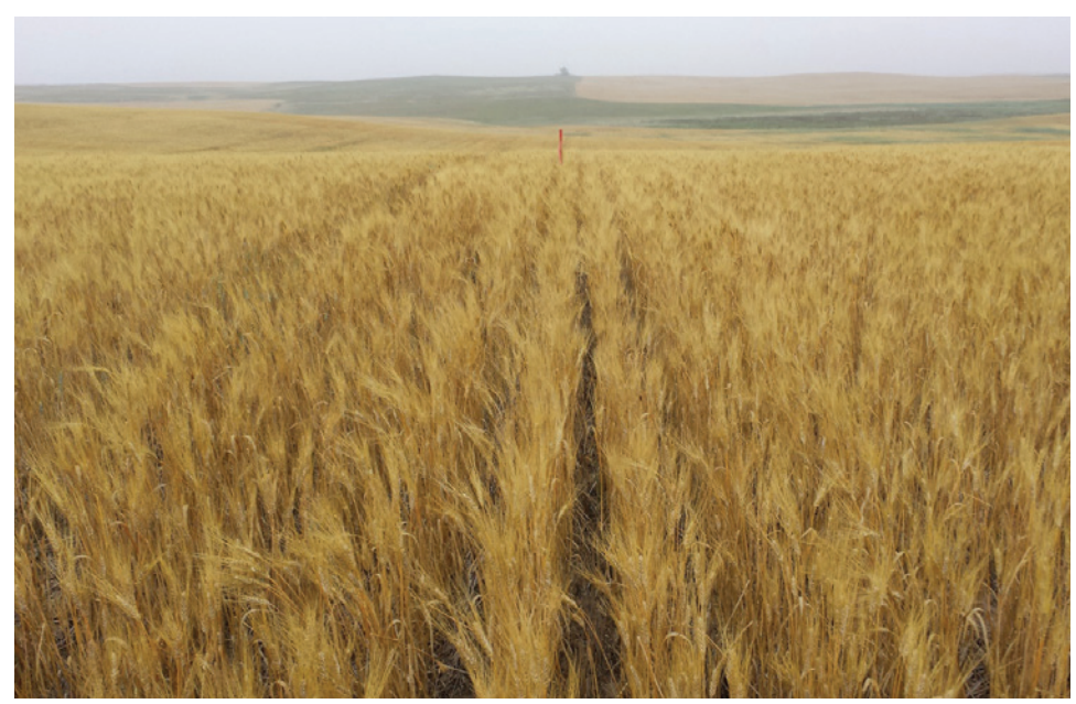
A reclaimed well site in Alberta.

Orphan Well & Large Facility Levies Total Contribution: