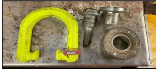
Fig. 1. Disassembled lifting eye. Pieces from Left-Right: D-ring, bolt, washer, nut